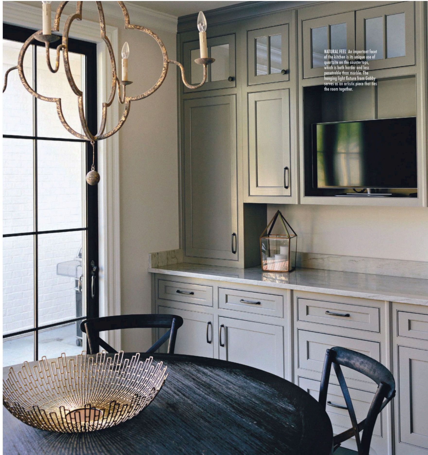
NATURAL FEEL An important facet of the kitchen is its unique use of quartzite on the countertops, which is both harder and less penetrable than marble. The hanging light fixture from Gabby serves as an artistic piece that ties the room together.